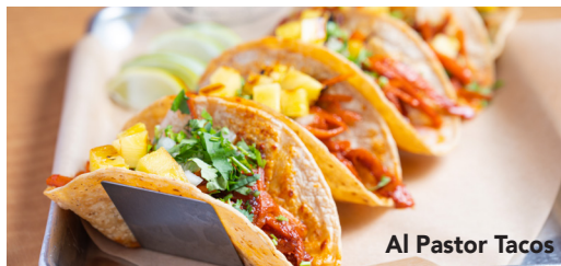
Al Pastor Tacos