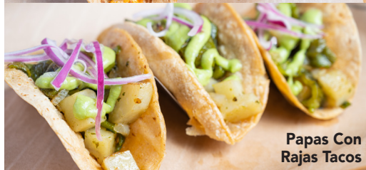
Papas Con Rajas Tacos