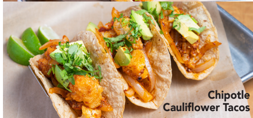
Chipotle Cauliflower Tacos