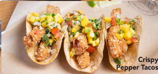
Crispy Pepper Tacos