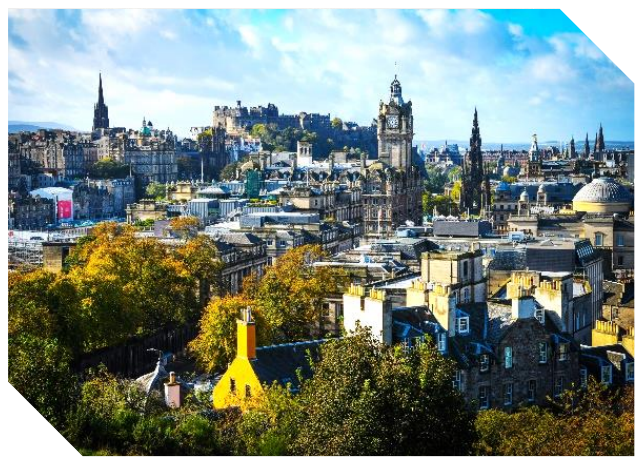
residential areas of Corstorphine and Ravelston, and the wards of Almond,

North West locality encompasses a broad range of communities from the historic villages of Cramond and South Queensferry in the semi-rural west to the