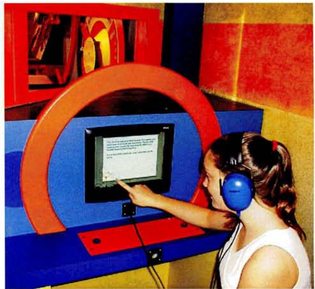
Figure 4. Visitors are given the opportunity to participate in ongoing research on the relationship between noise exposures and the presence of tinnitus and hearing loss in the population. Data are continually transferred from the museum to the Oregon Hearing Research Center for analysis. In addition, a subset of the data can be viewed online at the Dangerous Decibels website ( www.dangerousdecibels.org ) in the Information Center, Exhibit Research section. To date, results from over 36,000 subjects, from the ages of 6 to 85 years, can be accessed for study by the public.

Effectiveness evaluation of the Dangerous Decibels classroom intervention included baseline post-presentation, and one-month follow-up questionnaires with control and study groups. Results of the study demonstrated significant changes in knowledge, attitudes and behavioral intent regarding hearing loss prevention practices. 4th and 7th grade students (N=507) significantly improved across all knowledge items,