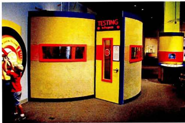
Figure 3. The Listen Up! exhibit in the Dangerous Decibels exhibit is a custom designed chamber that meets ANSI testing standards. It houses an educational, interactive computer-based game that acquires epidemiological and physiological data from visitors.

to noise-induced cochlear damage (Figure 3, 4). While visitors are playing, it also acquires demographic information and a history of recent noise exposures. Visitors are given the results of their hearing screening and information about their personal risk factors for exposure to hazardous noise. Over 36,000 visitors to Listen Up! have elected to include their test results in an OHRC study of automated hearing health data acquisition. The system has been shown to provide valid and reliable results for information gathering and hearing screening in an unsupervised setting.