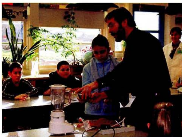
Figure 2. The Dangerous Decibels classroom outreach program uses "inquiry-based learning" methods to engage kindergarten through high-school students. Here a student is learning to measure sound levels and the principle of sound pressure diminishing with distance from the source. The science-rich, age-appropriate curriculum includes the physics of sound, normal function and pathophysiology of hearing, consequences of hearing loss and methods of hearing loss prevention. The program was developed by collaborations between hearing scientists, educators and health communications experts.

and Southwest Washington. The formative evaluations included student and teacher focus groups conducted by external evaluators, teacher consultants, and educational experts from OMSI. OHRC and OMSI staff have developed an educator training program that has been used to train school nurses, high school students, audiologists, speech pathologists, teachers and other interested individuals as presenters of the Dangerous Decibels curriculum. Graphical displays, 3-D models and interactive "hands-on" activities provide a multimodal learning experience. Educators are provided the extensive Dangerous Decibels Teacher's Resource Guide containing simple strategies for age-appropriate classroom activities that meet state-mandated educational goals and benchmarks. The Teacher's Resource Guide can be downloaded from the Dangerous Decibels website ( www.dangerousdecibels.org ). The classroom program has been presented to and well received by all age groups.