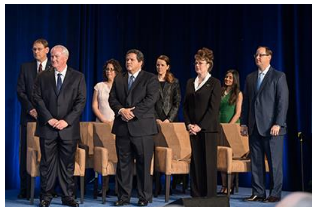
On stage at the awards ceremony, these are the 2016 Malcolm Baldrige National Quality Award recipients.