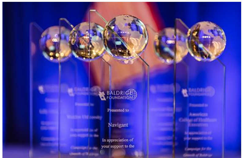
The Foundation presented these beautiful crystals to ten organizations in recognition of their support of the Foundation's efforts to grow the Baldrige Enterprise.

The Foundation took center stage Monday and Tuesday to celebrate several organizations that have already stood-up and demonstrated their support for Baldrige.