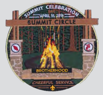
6" Summit Circle Dedication Patch, April 2016