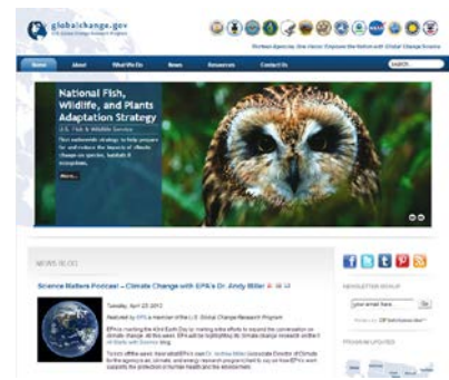
The new look for globalchange.gov

We are happy to announce the launch of USGCRP's refreshed website at <a href="www.globalchange.gov">www.globalchange.gov</a>, providing information about what is new in global change science across the Federal government and why it matters. The site is designed to highlight agency achievements, more clearly explain programmatic activities, and better direct viewers to relevant information in each of the agencies. Dynamically generated content will be easily accessible through the site's new blog, and users will have the ability to share content through a variety of social media networks.