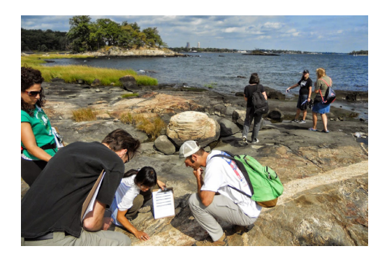
Teachers learn how to do a marine debris shoreline survey.

"I learned where the rocks on the beach came from and another way to classify them. Since I am not Environmental Science certified, this really helped me."