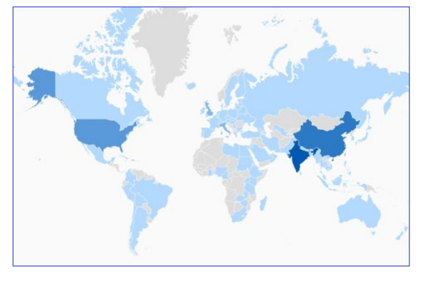
Geographic Distribution of Food Fraud Incidents

email: <u>techsolutions@foodchainid.com</u> More information on <u>www.foodchainid.com/</u> technical-services/ingredient-risk-assessment/