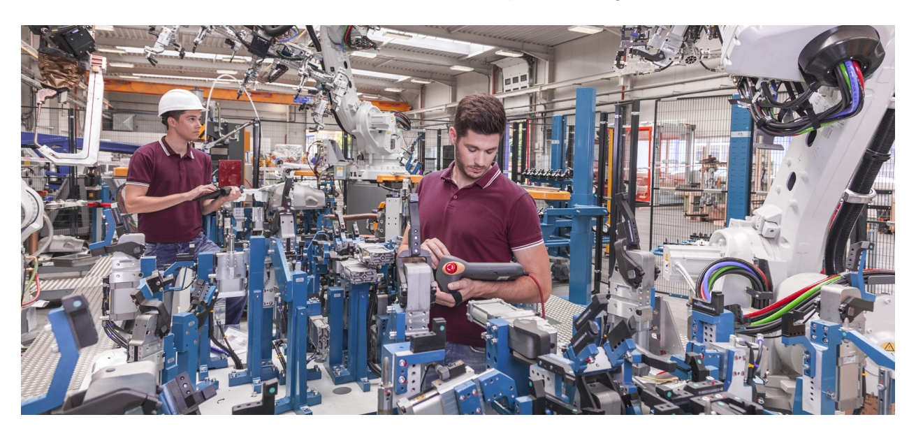
Figure 2. Cobots working alongside humans in a factory environment.

Until recently, most logistics robots used predefined routes; they are now capable of adjusting their navigation based on the location of other robots, humans and packages. Ultrasonic, infrared and LIDAR sensing are all enabling technologies. Because of the robot's mobility, the control unit is located inside, often with wireless communication to a central remote control. Logistics robots are now adopting advanced technologies such as ML logic, human-machine collaboration and environmental analysis technologies.