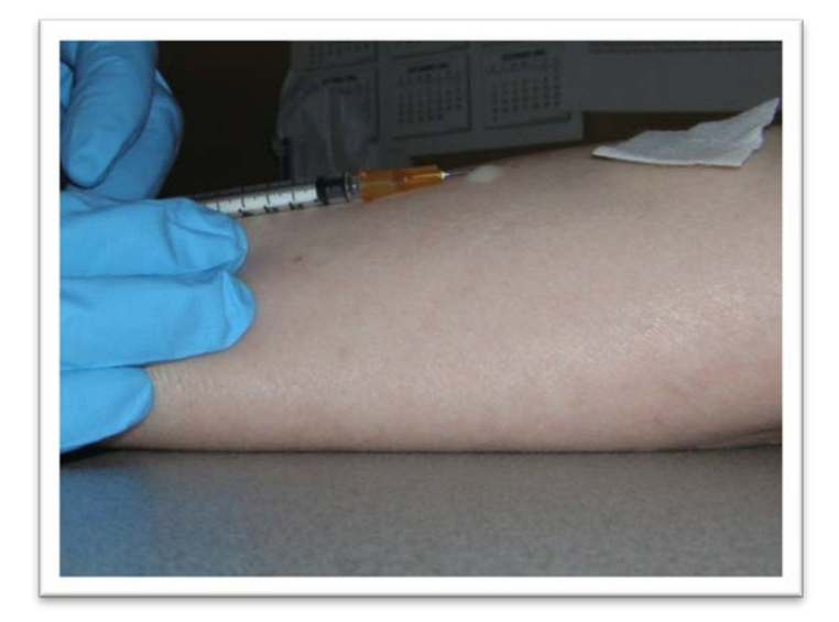
Figure 1. Technique of administration of TST