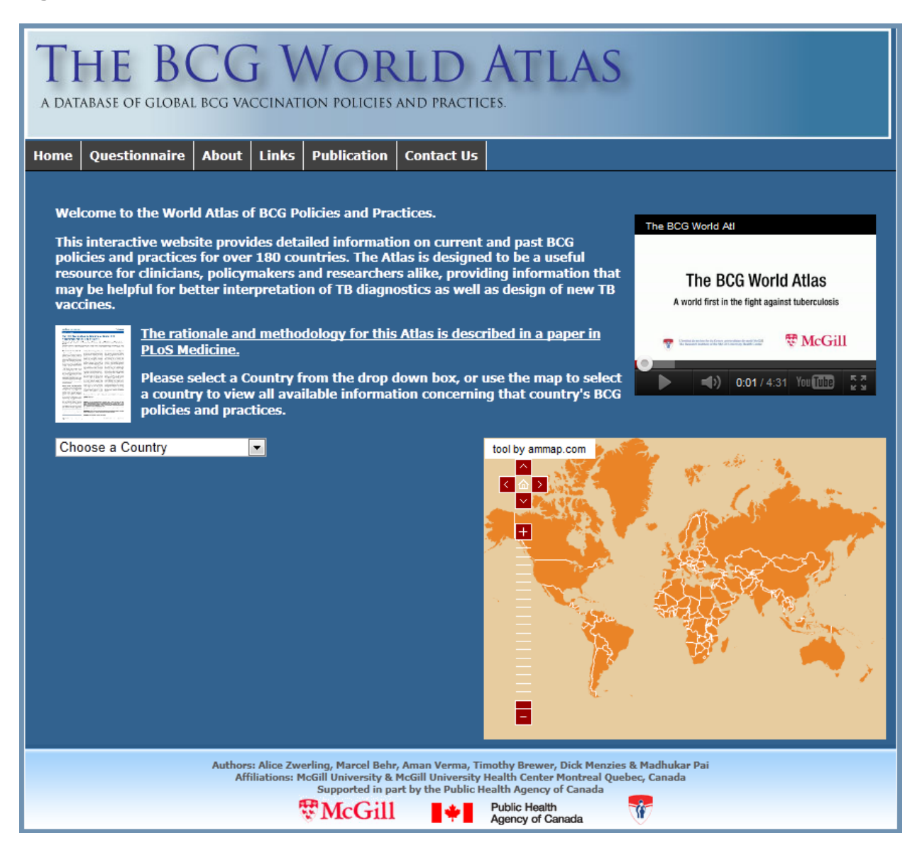
Figure 4. Screenshot of the BCG World Atlas