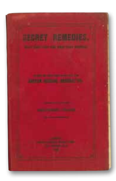
Figure 1. Secret remedies What they cost and what they contain, 1909.

medicines<sup>199</sup> and remedies criticised the BMA because it accepted adverts for some of the products in the BMJ. This was a controversial relationship with advertisers that continued for many years. It even provoked criticisms from the BMA's sister organisations in the United States and Canada, which had also previously accepted such adverts. While the Select Committee had serious concerns over parts of the trade, the report was published on the same day that hostilities broke out among the Central Powers in Europe, signalling the start of First World War. The report was shelved.<sup>200</sup>