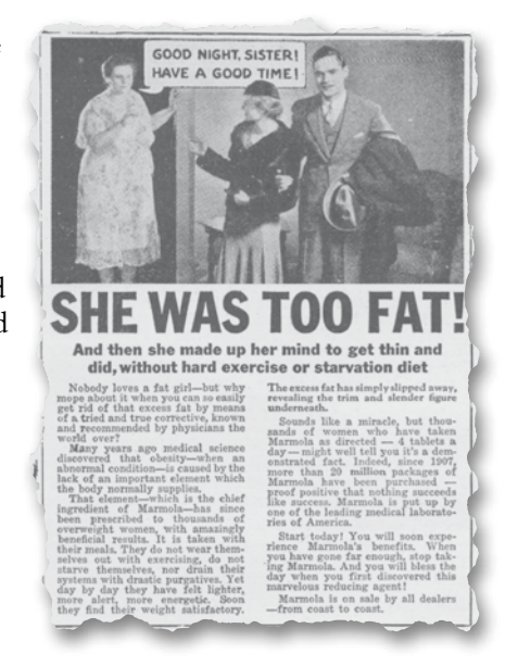
Figure 2. 'She was too fat'. Advert for Marmola which contained animal thyroid gland extract, 1933.

general stores and chemists as well as by mail order. The advertising strategies were often similar to those used today: as well as playing on the insecurities of consumers, the effectiveness, quality and safety of the products were a cornerstone of any campaign (Figure 2). These were usually supported by testimonials from 'customers', which in some cases included the rich and famous. For products ordered through the mail, discretion was often guaranteed; some sellers even offered express delivery. 194,195,203,204 The growth in these types of drugs was largely unrestricted as there was little regulation. Typically, so long as the products contained no scheduled 'poisons' (substances such as opium, which were regarded dangerous under the law), then there was little that the authorities could do to prevent their sale. 108,198,199,204