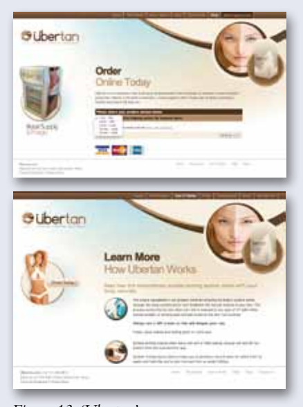
Figure 13. 'Ubertan'.

In 2011, the tanning product Ubertan was sold in the UK as 'a natural blend of melanin producing amino and fatty acids which is administered daily until the desired colour is reached ... using the easy to administer nasal spray applicator.' It was found to contain the potent untested synthetic peptide hormone melanotan II that increases the amount of the pigment melanin produced by the body. 483