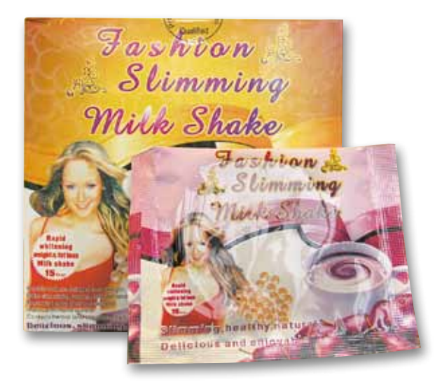
Figure 7. 'Fashion slimming milkshake' that contained the banned appetite suppressant sibutramine. Seized by the Danish Medicines Agency.

lead to environmental harm, including contaminating drinking water supplies.672-677 The benefits or harms that the drugs may bring could also increase inequalities in society. 96-99,106,107 Those who are wealthy will be able to access quality assured drugs, health information and monitoring through private medical consultations. This would allow them to maximise benefits while minimising harm. Wealthy people already have longer lives and better health. Yet in other situations (poorer) people may be pressured into using these drugs believing that they are their best option in order to 'stay in the game' or 'succeed'.