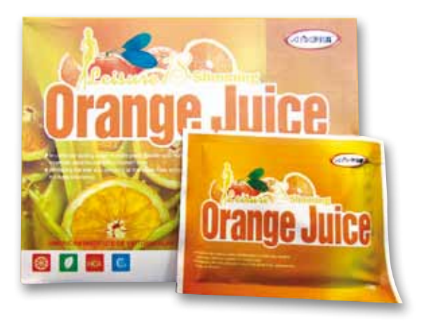
Figure 6. 'Slimming orange juice' that contained the banned appetite suppressant sibutramine. Seized by the Danish Medicines Agency.

However, there are also broader issues related to this drug use. Realising the huge profits and with a limited chance of getting caught and prosecuted, organised crime has become involved in the trade. 650-653,661 This, along with scams from others involved in this trade, and poor security found on many online shops, will lead to consumers being the victims of fraud, or even having their personal information stolen or exposed.<sup>296,663–671</sup> The waste from the manufacture, use and disposal of these drugs can