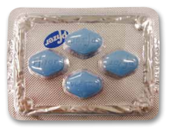
Figure 22. 'Viagra' seized by Merseyside Police

These drugs are also contraindicated with volatile nitrates/nitrites, such as poppers, which are used recreationally as well as nitrates used as a medical treatment. 1230 Studies have shown that these drugs are used together for recreational reasons. This can cause serious harms. One of the greatest risks is from the use of adulterated and untested drugs bought from the illicit market (Figure 21, 22). 459 Importantly, this market appears to be an important source of the drugs in the UK. 654 More recently there has been a large growth in the number of food and herbal supplements sold as sexual enhancement products. Many of these have been found to contain untested analogues of sildenafil, tadalafil and vardenafil. 390,392 These are not declared on the packaging/labelling. In 2009 adulterated 'herbal supplements' as well as counterfeit tadalafil, sold in Singapore and Hong Kong, caused serious harm in more than 220 people, 13 of whom subsequently died (§4.3). 548-555