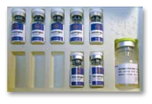
Figure 15. Growth hormone from the illicit market, seized by Merseyside Police.

estimates of the cost of growth hormone on the illicit market in the UK during the 1990s suggested costs of £6.58 to £20 per IU (International Unit). Recent data drawn from a small convenience sample of products available on the illicit market in South East England in 2008 found a number of different products on offer that varied between £1 and £8.33 per IU (Box 3.9)924 (Figure 15).