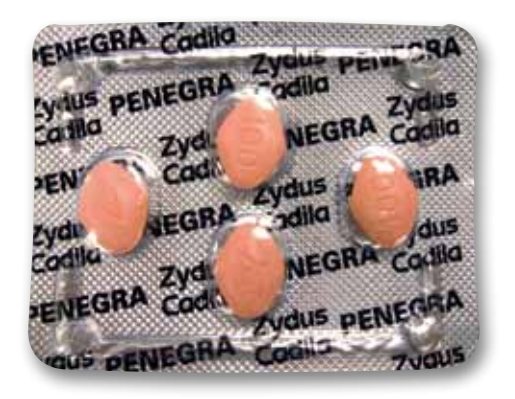
Figure 21. 'Penegra' purported to contain sildenafil which is the active substance in Viagra. Seized by Merseyside Police.

Sildenafil, tadalafil and vardenafil have well–established safety profiles when prescribed within their approved indications. However, there are specific cautions and contraindications. <sup>1128,1129</sup> They are contraindicated in HIV positive individuals being treated with the anti–retrovirals saquinavir and ritonavir. This may be of importance given the high prevalence of erectile dysfunction reported by HIV–positive individuals and the relatively high usage of these drugs by men who have sex with men.