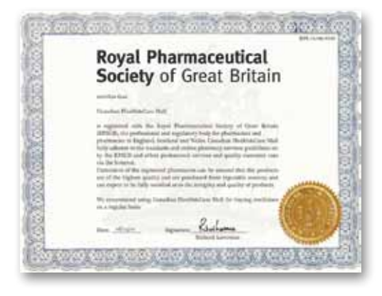
Figure 11. 'Fake certificate used on an Internet shop selling drugs. It purports to be from the Royal Pharmaceutical Society of Great Britain and states that 'customers ... can be assured that the products are of the highest quality and are purchases from reputable sources ... We recommend using... for buying medicines on a regular basis'.

pharmacies tested most did not provide adequate protection for their customers. 667 Products are delivered 'signed, sealed and private', the service is 'secure & discreet'. These features may play on consumers' embarrassment given the stigma attached to some of the uses for these drugs. 654 This is reflected in the common belief that the Internet provides anonymity for such purchases. Curiously one recent study that looked at drugs such as sildenafil (for erectile dysfunction) bought from the Internet found that just over two-thirds of men were not concerned about the privacy of their personal information in such transactions.654