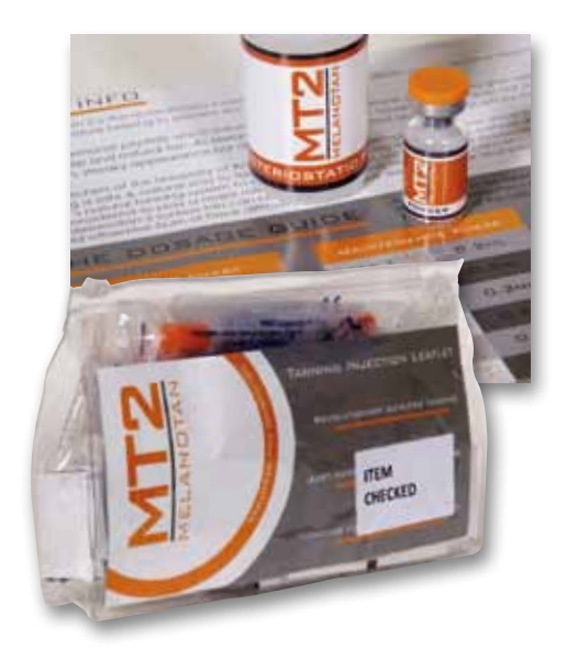
Figure 18. 'Colouring you beautiful'. Melanotan II 'tanning kit'. Sold by a UK website, it contains the untested synthetic peptide hormone melanotan II, along with bacteriostatic water to reconstitute the drug and a leaflet on how to use it.

'maintenance phase' of one to three doses per week in order to maintain the tan. Some sites recommend using a tanning bed to achieve a 'quicker' or 'more even' tan (Figure 18). Much of this information appears to be based on the interpretation of early clinical trials of the drugs.