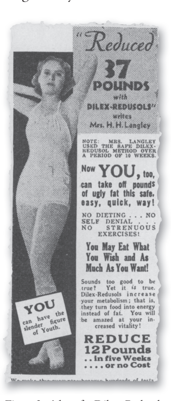
Figure 3. Advert for Dilux-Redusols which contained the metabolic poison dinitrophenol, 1936.

bring you a figure men admire and women envy without danger to your health or change in your regular mode of living'. 761 'No dieting... No self-denial... No strenuous exercises... You can have the slender figure of Youth'. 749 Testimonies again played a supporting role: 'we feel much better and it has shown absolutely no ill effects', 'literally burning the fat away'. 'Sounds too good to be true? Yet it is true'<sup>761</sup> (Figure 3). The drug was also hidden in some weight loss products so consumers had no idea they were taking it. 760 DNP could cause weight loss, although it was not long before harms were reported (such as skin rashes, numbness and tingling in the legs and arms, loss of taste and a dangerous drop in the number of white blood cells that fight off infections). There were also at least 10 deaths, the first published just three months after the initial report of its clinical trial in humans.<sup>i</sup> In some cases this was because consumers had inadvertently overdosed on the drug because they were not satisfied with their weight loss. The drug was also found to be unpredictable: the toxic dose could be close to the therapeutic dose. Almost two years to the date from the first use of DNP, reports began to surface of cataracts linked to its use. Eventually more than 160 cases were identified.704-707,726-773,ii