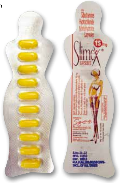
Figure 16. 'Slimex capsules'. The product claims to contain the banned appetite suppressant sibutramine. Seized by Merseyside Police.

Overall this has led to a multi-billon pound diet and weight loss industry. It is estimated that 95% of women have dieted at some stage in the lives, with 40% dieting at any one time. 45 One survey in 2004 found that 15% of adults in the UK were seriously trying to lose weight. 1035,1036 Lifestyle changes such as cutting out fatty foods, eating less, or exercising, are common methods that are used to achieve weight loss. 1037,1038 Recent years have also seen a large increase in the number of