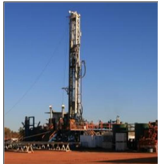
Atlas Rig #2