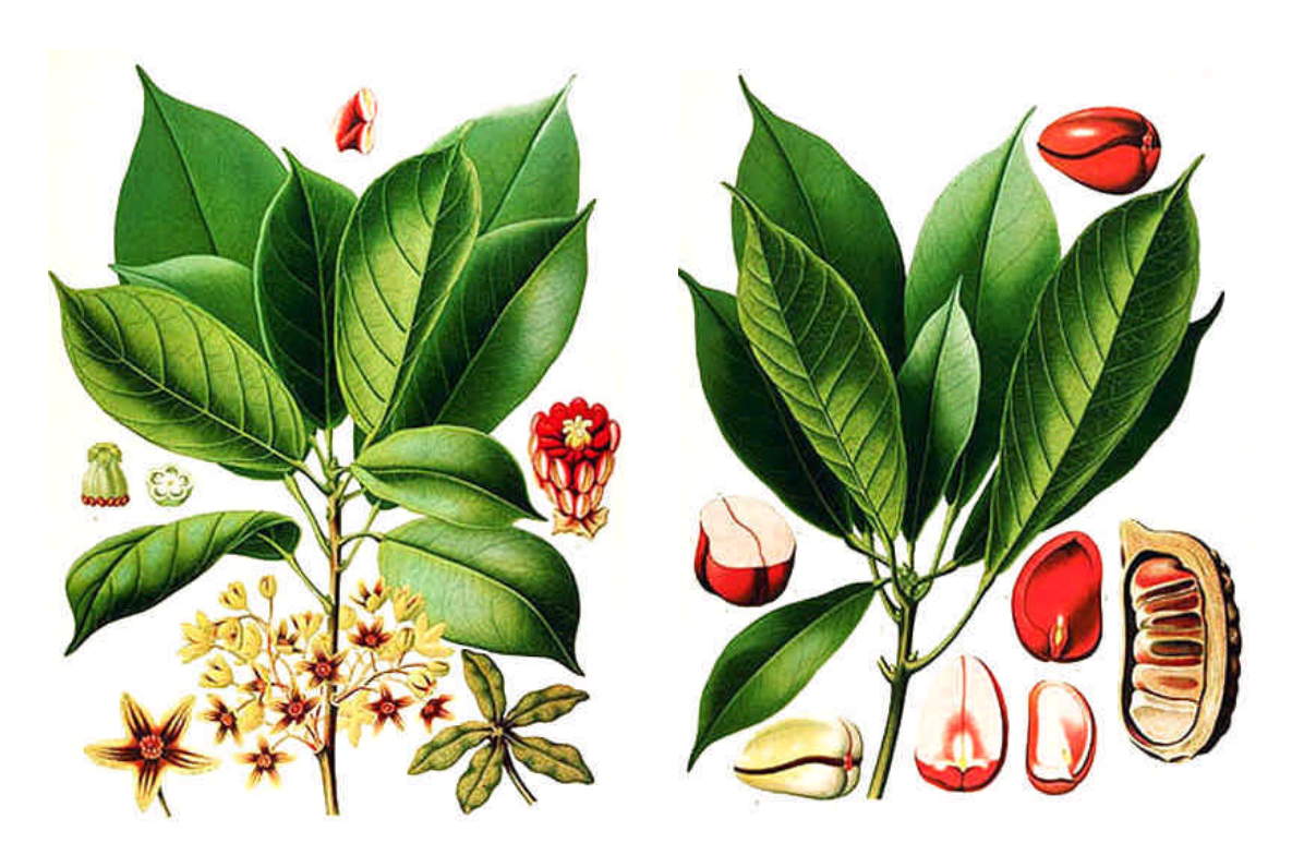
Cola acuminata - Flowers

These following diagrams are from Hermann A. Köhler's work <u>Medizinal Pflanzen</u>, published in 1887.