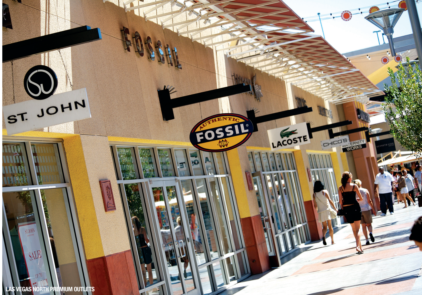
LAS VEGAS NORTH PREMIUM OUTLETS