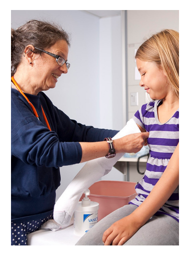
When your rash is very severe, your health care provider may recommend wet wraps.

People with atopic dermatitis may struggle with a poor self-image and low self-esteem. In severe cases, the appearance of their skin can invite teasing and, especially in children, interfere with peer relationships. The sleep disturbances that may occur with atopic dermatitis can put added stress on the family. People with atopic dermatitis who are having a lot