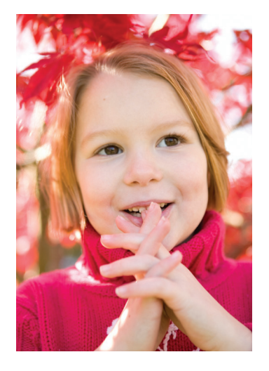
An allergist or dermatologist can provide expert evaluation.

If you answer yes to any of these questions, talk with your health care provider about atopic dermatitis. You will be asked questions about your health and your skin. Be sure to tell your health care provider if you or anyone in your family has had a similar rash, asthma or allergies.