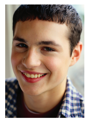
Daily "Soak and Seal" skin care must continue during topical treatment. After soaking, apply the topical medicine to your rash and your usual moisturizer to the rest of your skin.

Skin infections are caused by bacteria (impetigo), fungus (athlete's foot), and viruses (cold sores). Some antibiotics, antifungal and antiviral medications are applied to the skin; others are pills or liquids taken by mouth. A skin infection can quickly get out of control. Call your health care provider right away if you think you have an infection.