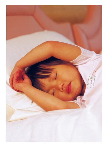
The bedroom is the most important room to make skin friendly.

Learn as much as you can about your disease and how to manage it.